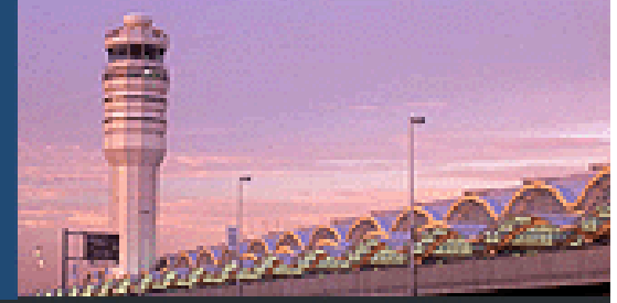
› Reagan National Airport